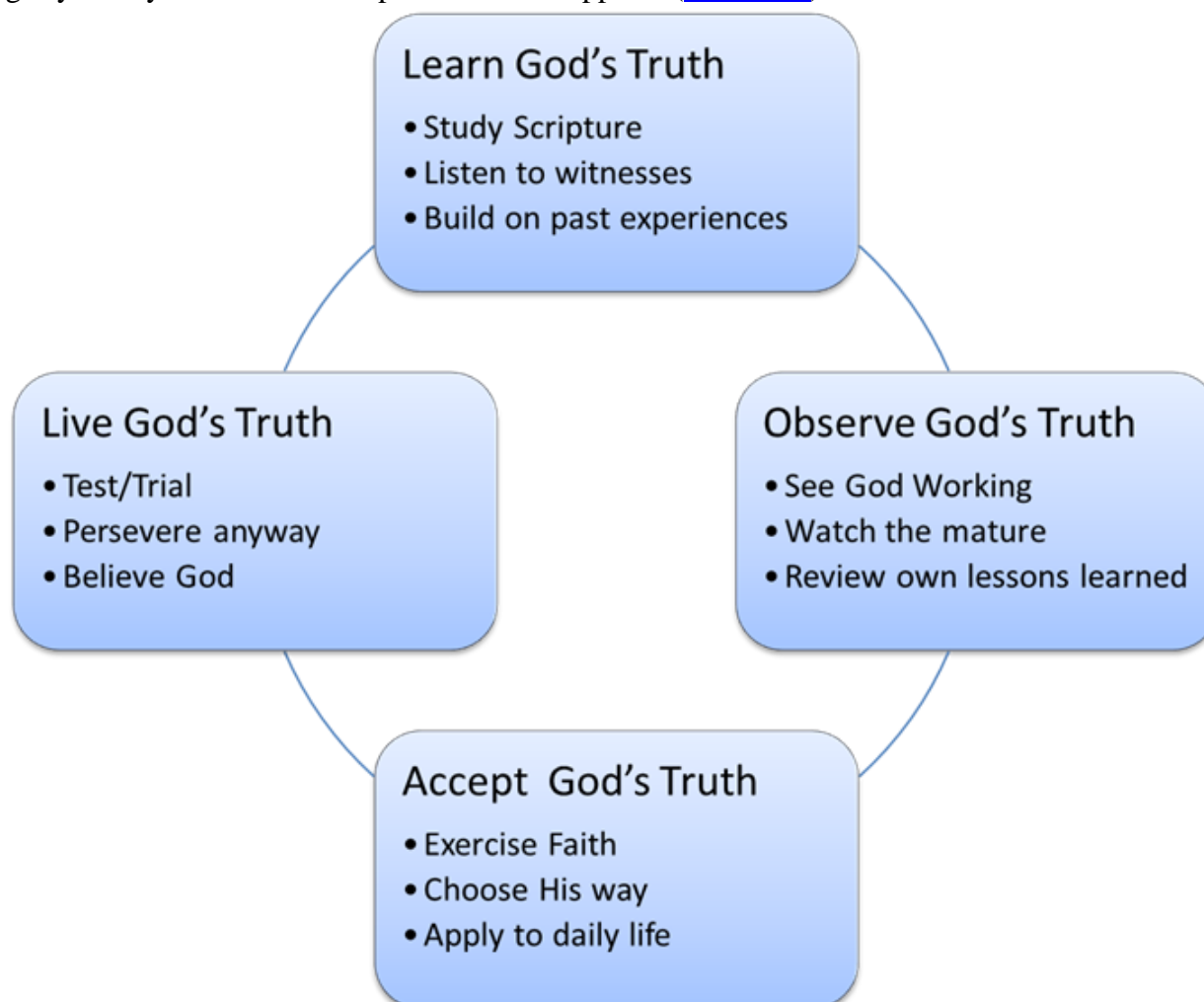
Figure 1 - Faith Building Cycle

Believe God first and foremost; when you do everything will begin to make sense! Start anywhere in the Faith Building Cycle (Fig 1) believing God just as Abraham did and the blinding darkness of the effect of sin will begin to lift. Once you start reflecting/meditating on the Son of the Living God you will begin your “transformation” (Greek: metamorphose) into His likeness, knowing God and His love lives within you in this world ( 1 Jn 4:13-18 ), with an ever-increasing glory until you are made complete when He appears ( 1 Jn 3:1-3 ).